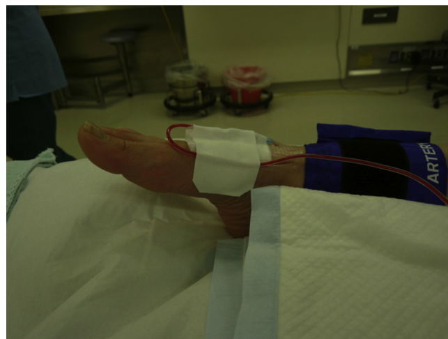
Fig. 3. The patient had upper-limb defects, and the vital signs and other systemic parameters were monitored by electrocardiography, non-invasive sphygmomanometry, invasive arterial pressure measurements, pulse oximetry and neuromuscular block monitoring throughout the procedure.

patient's heart rate was 70–80 beats per minute, and blood pressure was 120/60 mmHg as measured using the Nihon Kohden device and 110/50 mmHg as measured using the Terumo device. Both the blood pressure values remained almost constant, with little variations. The invasively measured blood pressure was 100/50 mmHg, the systolic blood pressure being 10–20 mmHg lower and diastolic blood pressure being 10 mmHg lower than the noninvasively measured blood pressure. The anaesthesia was maintained with sevoflurane and ropivacaine. The patient's cardiovascular and respiratory status remained stable throughout the procedure. The operating time was 1 h and 17 min, and the anaesthesia time was 2 h and 35 min. The postoperative course was uneventful.