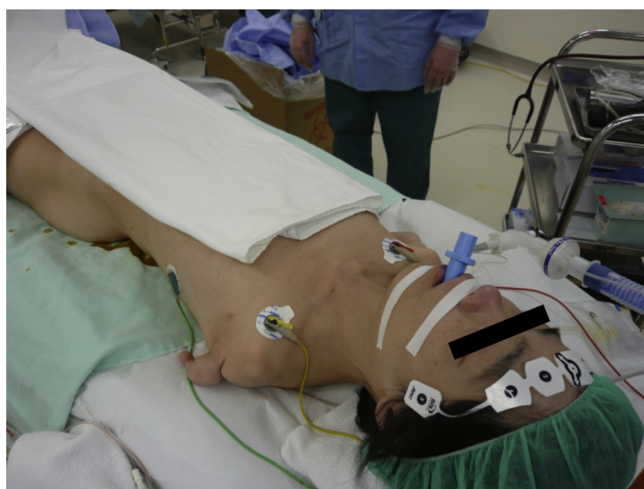
Fig. 2. The patient had upper-limb defects, and the vital signs and other systemic parameters were monitored by electrocardiography, non-invasive sphygmomanometry, invasive arterial pressure measurements, pulse oximetry and neuromuscular block monitoring throughout the procedure.

After induction of anaesthesia using propofol (60 mg), fentanyl (0.1 mg), and rocuronium (20 mg), tracheal intubation was performed. The intubation was relatively easy, and the Cormack–Lehane grade was 1. During anaesthesia induction, the